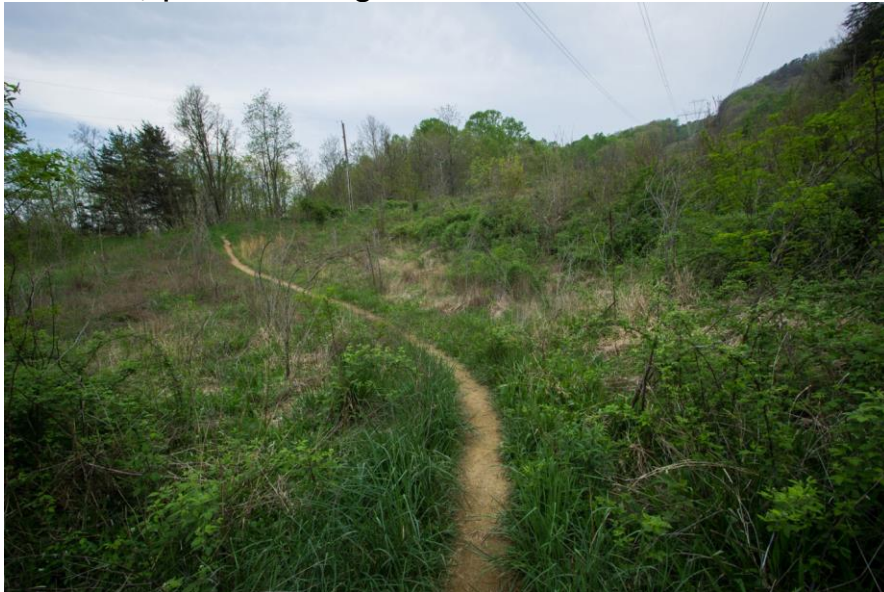
August 10, 2018