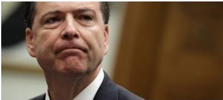
FBI Director Received Millions From Clinton Foundation- His Brother's Law Firm Does Clinton's Taxes

As of this writing, the Clinton Foundation , in its 20+ years of operation of being the largest International Charity Fraud in the history of mankind, has never been audited by the Internal Revenue Service. Let us not forget that Comey's brother works for DLA Piper , the law firm that does the Clinton Foundation's taxes.